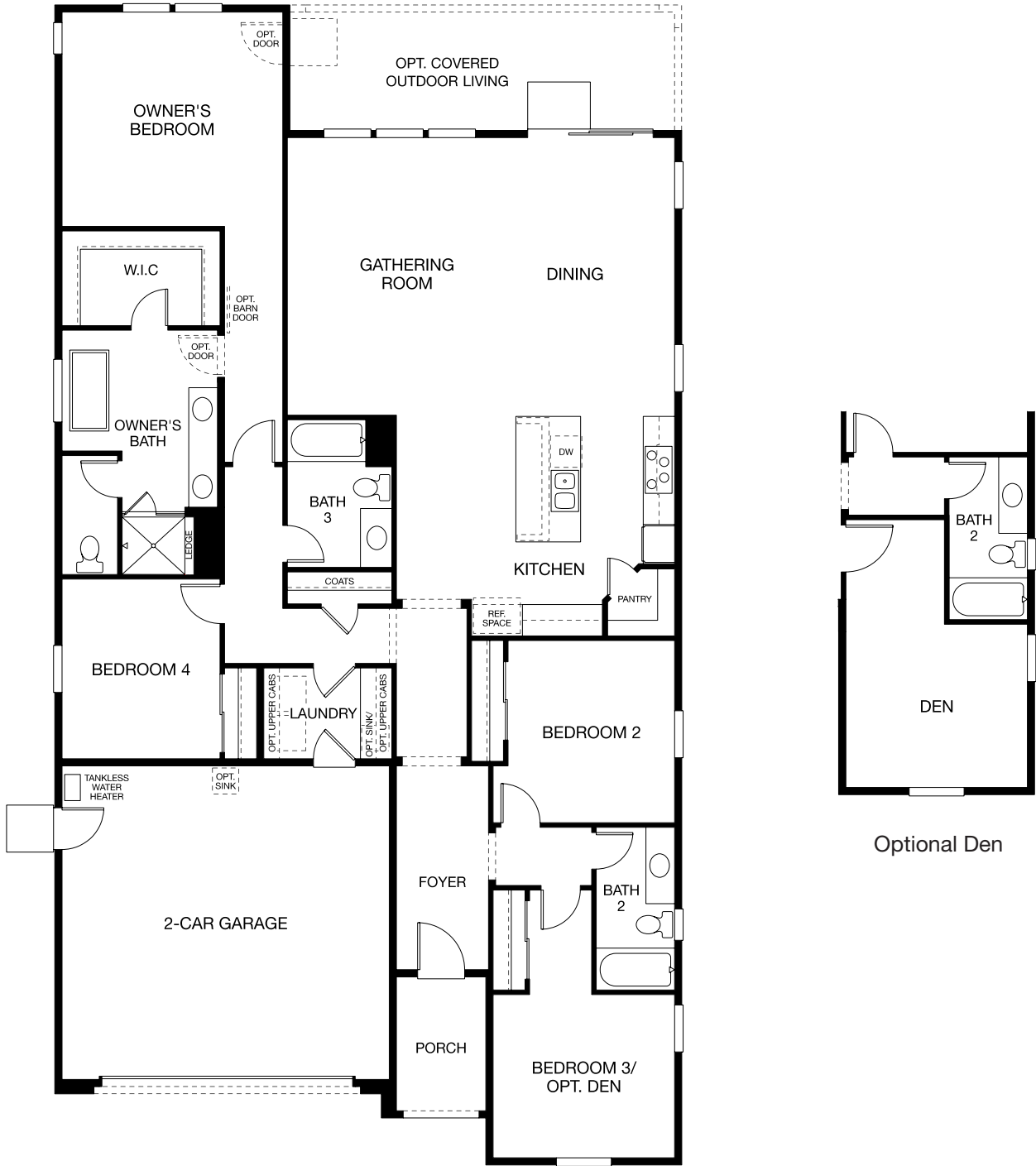
PRELIMINARY PLAN 4